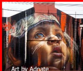
Art by Adnate